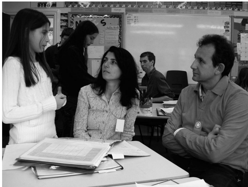
Several student-led conferences take place in classroom

Student-led conferences in a school with a very diverse population provide the opportunity for students to guide their parents or guardians through their recent “journey of learning”, using their mother tongue. Conference tables set up in each classroom are prepared with laminated question prompts translated into multiple languages, for the parents to refer to. The students take their parents or guardians to the tables, where they explain the objectives of the conference: to highlight their “journey of learning”, their personal growth, their challenges and their achievements. The students guide the adults through the contents of their portfolios, discussing the objectives of each included item and indicating their successes and room for growth. Each student has a “personal target sheet” to fill out as they reflect on successes and challenges. Teachers are present but stand apart from the conferences. As they guide the parents or guardians from room to room, the students have a “passport” to be signed by all teachers, to ensure that their development relevant to all areas of the curriculum is discussed.